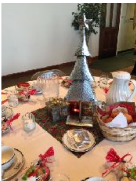
Table decorations from the Cornerstones Christmas lunch in 2016. The cooks brought in Christmas tree decor from home—an easy way to give each table a unique and festive look.

"The example of fellowship and welcome was there for me 30 years ago and made me feel a part of this church."