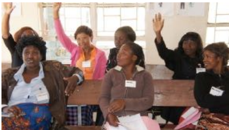
Caregivers at a training class

Hear more about the growing outreach of the organization at the annual benefit on November 10, hosted this year at Grace.