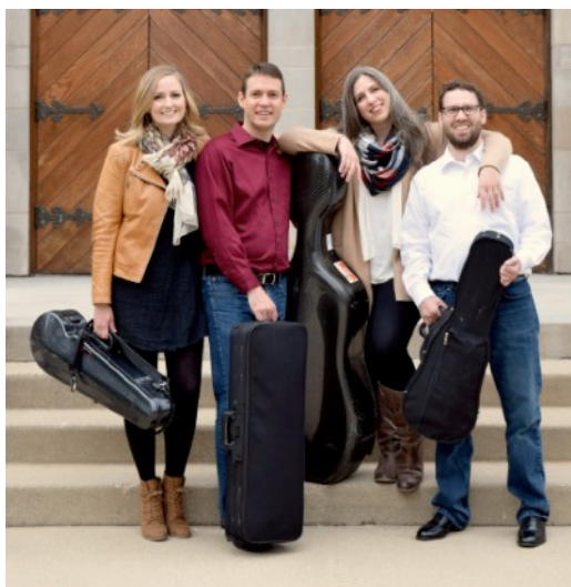
Kontras Quartet, in residence at Grace